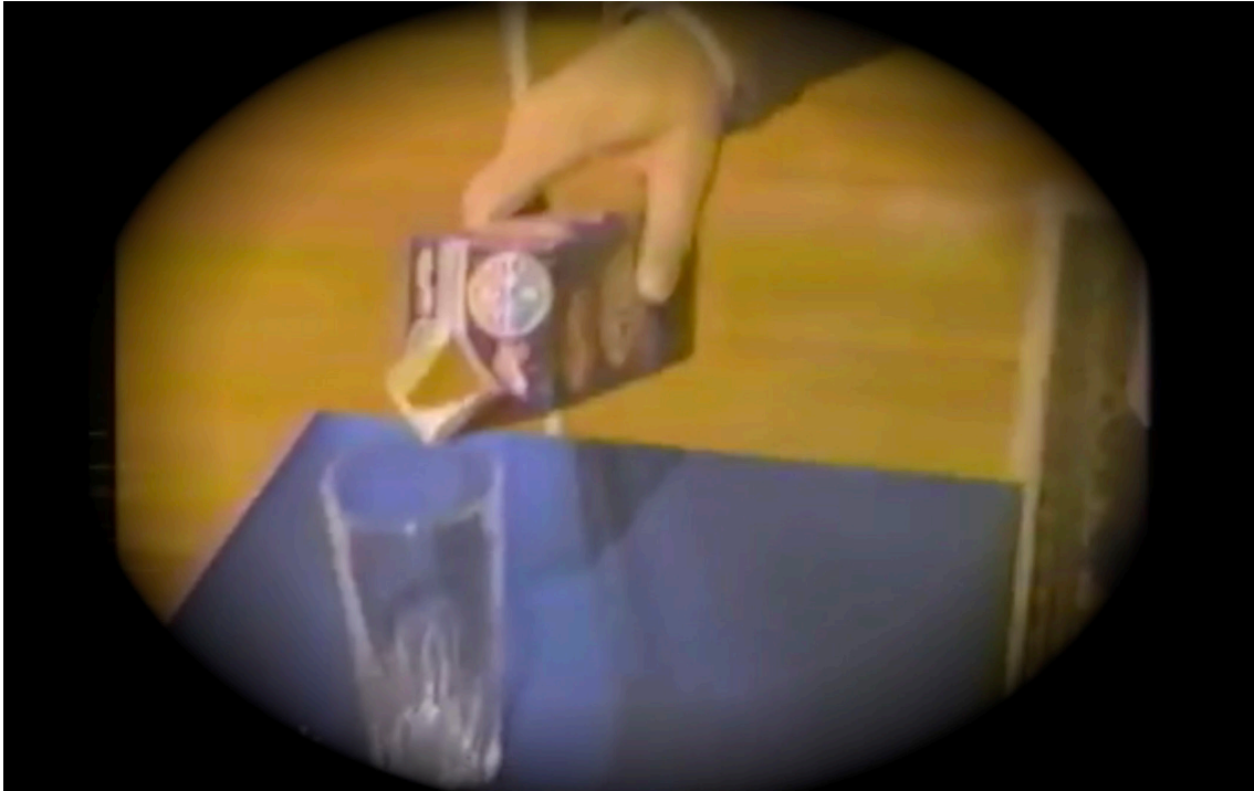
Video 2: Excerpt of the video created for Sasktronica (2017).

I have also always associated scores with schematics, and this goes back again to the electronics of my youth. Each one of the devices that my father repaired had its own schematic drawing that mapped all the inner components. These drawings are intricate and beautiful, akin to musical scores. They visually detail the correct way the electronic device is supposed to behave, just like a score visually details how a piece is supposed to behave—each with all its minutiae. And someone had to go to the trouble of creating this elaborate map of the device (and the score!)