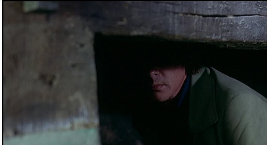
Figure 9: Tableau vivant . The Shout (Jerzy Skolimowski, Recorded Picture Company, 1978).

These tableaux vivants function as more than props or prompts (Figure 8; Figure 9). 21 Going beyond supporting character development and aiding the film narrative, they function to draw attention to the queer potential of Bacon's paintings. In this role, they contribute to the film as art writing. Art writing is writing about art that does not seek to explicate but rather, as a practice, to realize (something about) a work by way of processes akin to repetition or imitation (Rifkin 2021, p. 233). 22 This practice bears some similarity to Serge Cardinal's description of a mode of film writing that allows a film to speak for itself through the writer talking in its language.