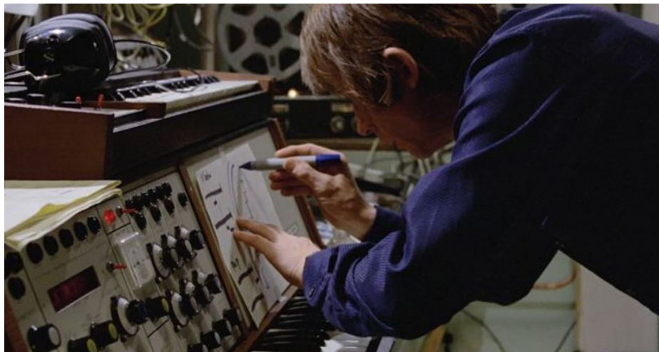
Figure 12: Audio technology and possibility. The Shout (Jerzy Skolimowski, Recorded Picture Company, 1978).

seems to signal the force of the vertical (Ahmed 2006, p. 107). 47 The shout therefore demands a queer orientation for its successful generation. In this, it echoes the scream in Bacon's paintings. In Bacon's paintings, the scream registers pleasure, it is an effect of queer sexual practices. The shout in the film, by contrast, is not a record of ecstasy but its cause . Anthony is overcome by Crossley's noisy ejaculation, falling in a faint, a sonically induced swoon. 48 The other men who buckle at Crossley's shout can similarly be read as exhibiting post-coital quiescence, as victims of a little death ( la petite mort ), rather than of the literal death a straight reading of The Shout invites. 49