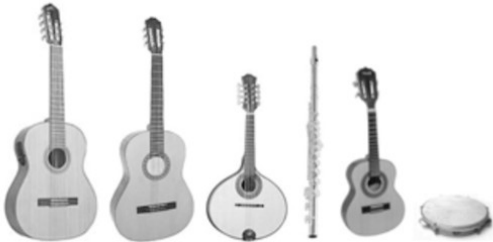
Figure 2: Traditional choro instruments.

In the early days, it was also common for pioneers of the genre such as Chiquinha Gonzaga (1847–1935) and Ernesto Júlio de Nazareth (1863–1954) to perform and compose choro on the piano.