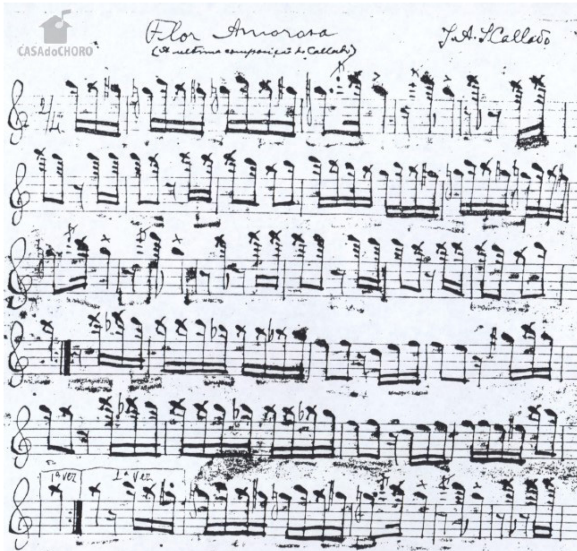
Figure 3: Flor Amorosa (1915) by J. A. Callado.

or meter. Melodies usually started on a weak beat of the bar, producing the effect of a shifted accent. Most importantly (but certainly not unique to this genre), although choro was notated by the choro composers, there was a great deal of discrepancy between what was written down in the score and how these pieces were performed in practice. Often, there were no indications of tempo, few or no articulation markings, and melodies written for one instrument in the score were played by various instruments in a lively interplay. For example, Flor Amorosa , a choro by Joaquim Callado, notated as just a melody with rhythmic indications (see Figure 3), is harmonized by a choro ensemble (see Video excerpt 1).