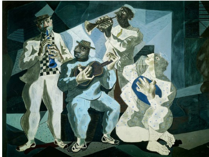
Figure 1: Chorinho by Candido Portinari, 1942 (© Candido Portinari).

According to Henrique Cazes, as the capital city grew, “[a]n urban middle class emerged, comprising public officials and small business-keepers. This middle class, largely made up of Afro-Brazilians, did not only serve as the driving force of choro , but also as the audience that consumed this type of music” (Cazes 2010, pp. 15–16; my translation). These choro groups improvised on well-known themes from European salon music, which made its way across the Atlantic to Brazil’s elite salons in Rio de Janeiro, and composed their own themes ( ibid. ). At the time, European salon music was being used as a foundation for the development of new distinct genres all over Latin and Central America (Brill 2018). Gerard Béhague, a prominent ethnomusicologist specialized in the music of Brazil, explained the transformation of European music in Brazil as follows: