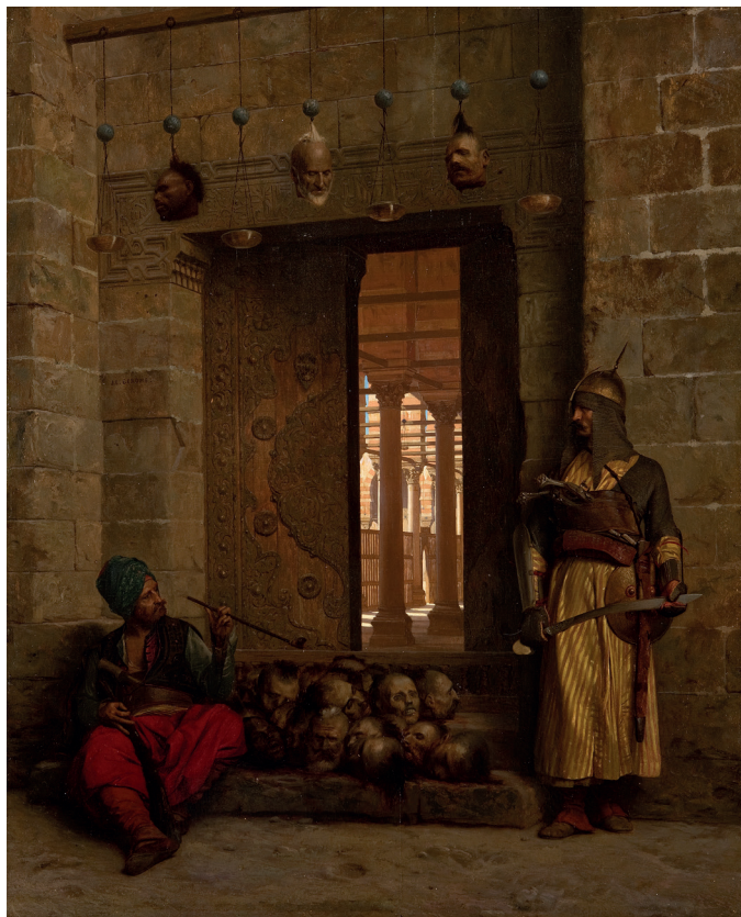
Figure 1: Jean-Leon Gérôme, The Doorway to the Mosque El Assaneyn in Cairo where the Heads of the Rebel Beys Were Exposed by Salek-Kachef, 1866. Oil on panel, 54 x 43,8 cm. OM. 184.