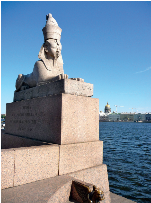
Figure 4: Egyptian Sphinx in front of the Academy of Arts in Saint Petersburg, 2012.

the Fontanka, and Quay with sphinxes at the Universitetskaya Embankment in Saint Petersburg (see Figure 4). The Sphinxes from the time of Pharaoh Amenhotep III (1390-1352 BC) were purchased and brought from Alexandria in 1832 by the Russian officer and diplomat Andrei Murav'ev. Initially the ancient monuments were located in the courtyard of the Russian Academy of Arts in Saint Petersburg, but in 1834 they were moved to the waterfront of the Neva River in front of the Imperial Academy of Arts (Struve 1912). To complement the architectonics, the Russian architect Konstantin Thon designed the pedestals for the Sphinxes and added columns and griffins to the site.